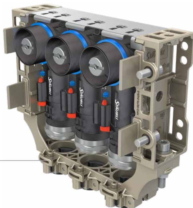
Dynamic Cable Option (DCO), optional